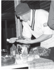
Bowlers need Fuel...