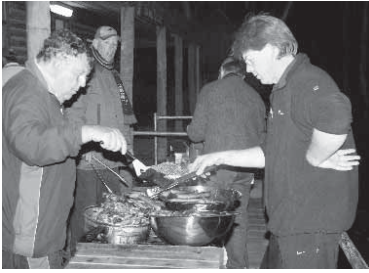
Bar-B-Q-ing is a 'Committee' Thing