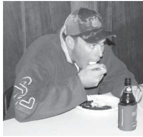
And so do Batsmen, too!